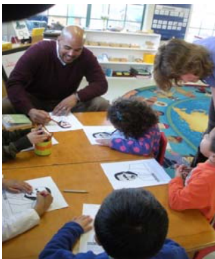
MLK presentation in the Snowy Egrets class