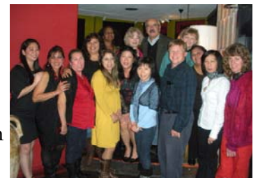
Keystone Montessori 2010 Holiday Staff Party