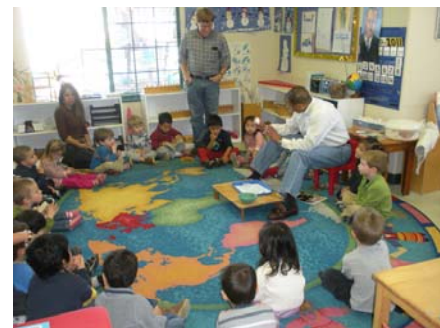
MLK presentation in the Blue Heron and Fledgling's classes.